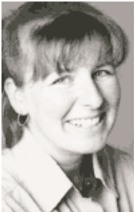
Parks Victoria Ranger

Formal involvement will be invited, and will include the establishment of a small number of Regional Reference Groups to provide for regional representation and advice on local marine planning issues