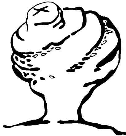
Figure 1. An illustration of a cunjevoi